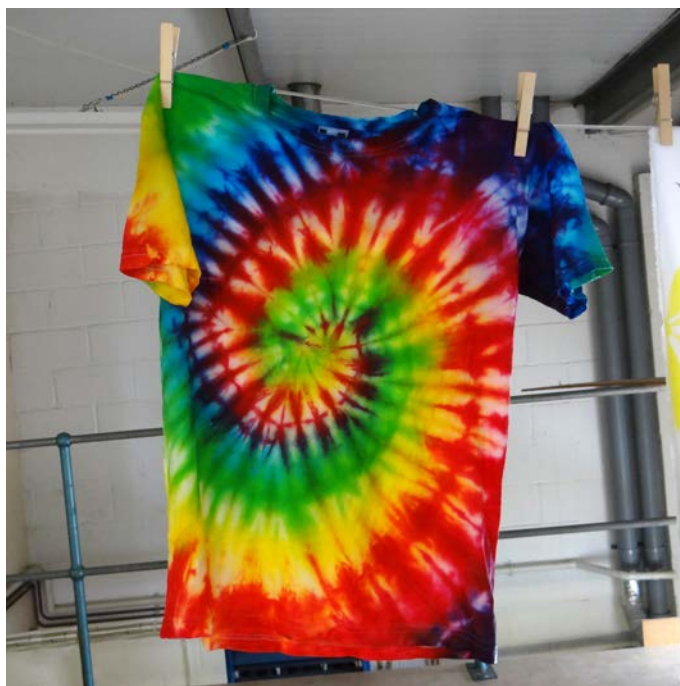
The Finished Shirt!

After 24 hours, unwrap the shirts and, leaving them tied, rinse in cold water until it runs clear. Untie and wash with non-bio detergent to remove excess dye.